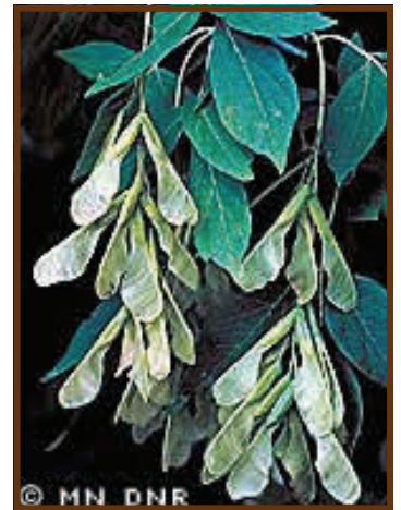
Minnesota Department of Natural Resources