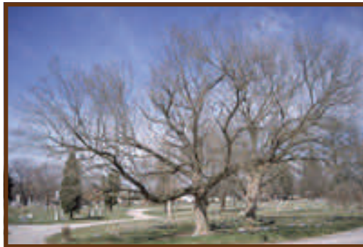
Ohio Department of Natural Resources