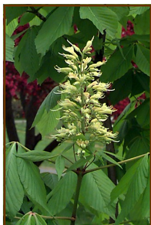
University of Connecticut Plant Database

The Ohio Buckeye prefers shady conditions in its youth, but grows in full sun to partial shade as it matures. It grows best in deep, moist, well-drained, acidic soil. Placing this tree in full or partial sun will result in the best foliage, while choosing a shadier area will produce better fruit and nuts.