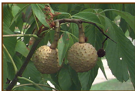
University of Connecticut Plant Database