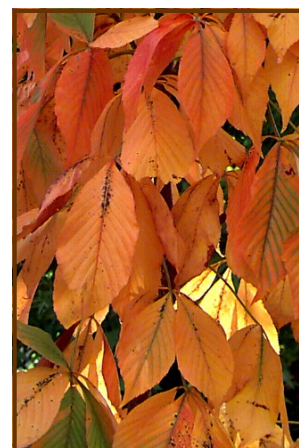
University of Connecticut Plant Database