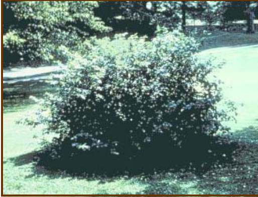
University of Connecticut Plant Database