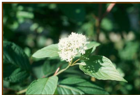
University of Wisconsin Urban Horticulture