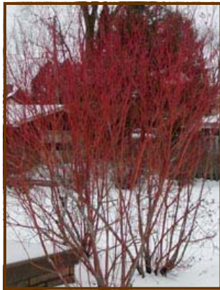
University of Wisconsin Extension

The Red-osier Dogwood is shade tolerant and adapted to both wet and dry sites and a variety of soil types. It is easily grown, but should be pruned periodically to maintain its vivid color. This shrub is particularly good for erosion control on stream banks because branch tips touching the ground will take root.