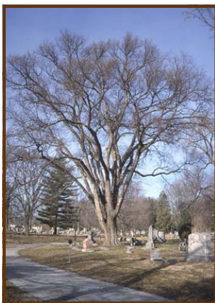
Ohio Department of Natural Resources Tree Index

The American Elm is a good choice for large yards and parks. It is very tolerant of urban conditions and was once the most common street tree. This tree is adaptable to most locations, as it tolerate various soil types, soil moistures, and sun exposures.