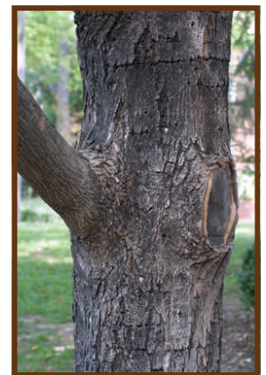
Vanderbilt University—Department of Biological Sciences