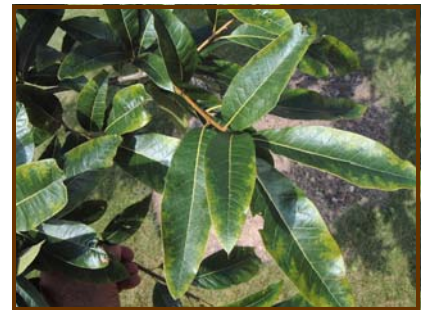
Penn State Arboretum