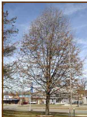
Eastern Illinois University Department of Biological Sciences