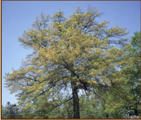
Ohio Department of Natural Resources Tree Index