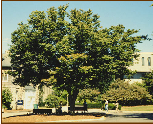
University of Connecticut Plant Database