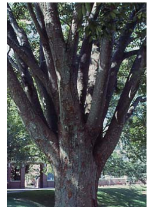
Wheaton College Tree Walk